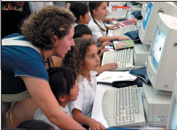
Costa Rica Schools

The COQS Index is a measure that combines four types of skills in using the Internet into an overall "digital literacy" score. The skills include: C ommunicating with others (by e-mail and other online methods); O btaining (or downloading) and installing software on a computer; Q uestioning the source of information on the Internet; and S earching for the required information using search engines.